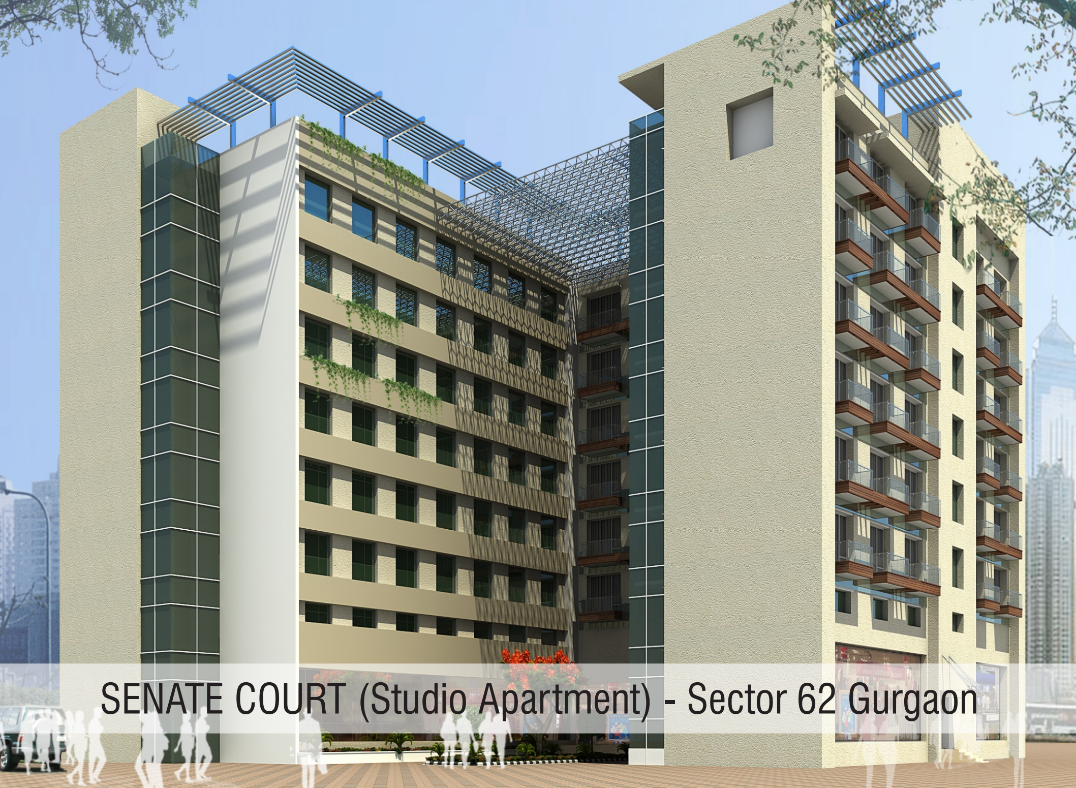
SENATE COURT (Studio Apartment) - Sector 62 Gurgaon